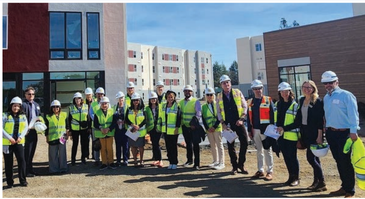
President’s Circle members touring student housing under construction.